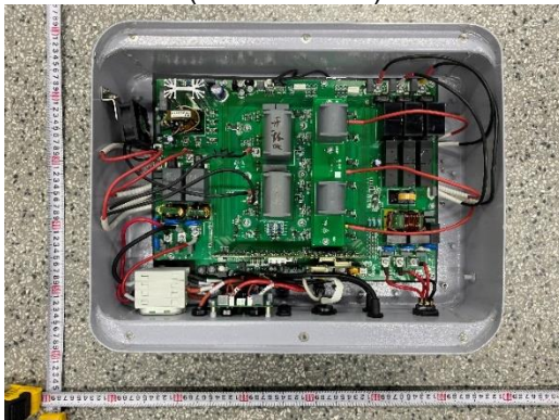
Inside view (VT-6615310)