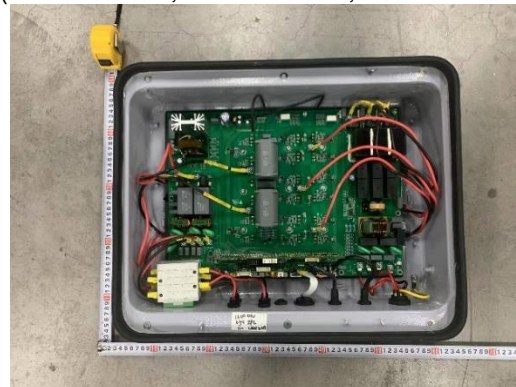
Inside view (VT-6605310, VT-6608310, VT-6610310)