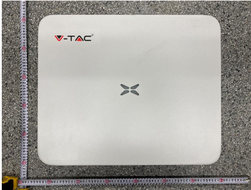
Over view (alternative LED cover board)