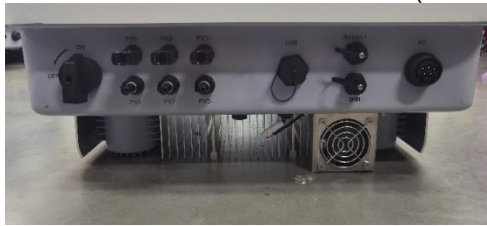
Terminal view (VT-6615310)