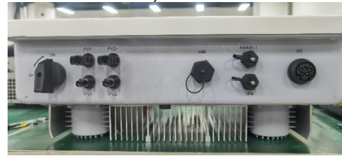
Terminal view (VT-6605310, VT-6608310, VT-6610310)